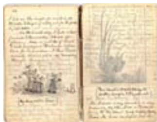
Above: John Muir's Diary