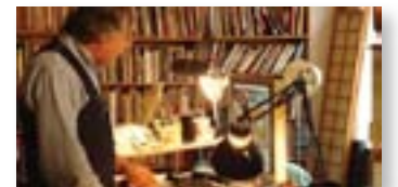
The Art of Spiegelman