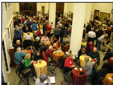
Scene from the 2012 Holiday Gathering. This event always sells out, get your tickets early!

Call 415.393.0100 or online at www.milibrary.org/events