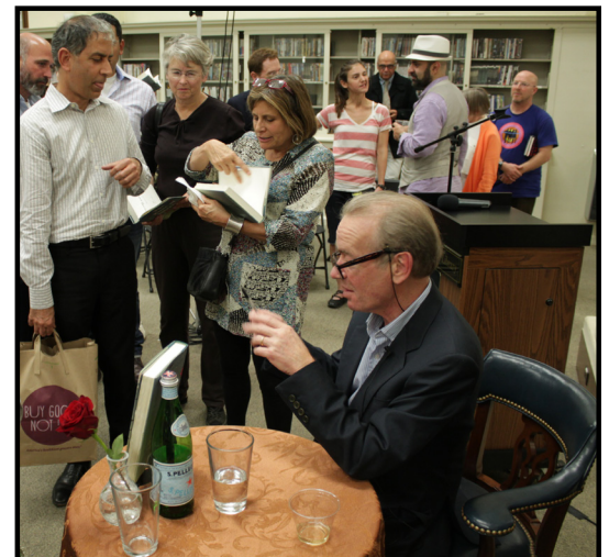
Author Martin Amis signing books