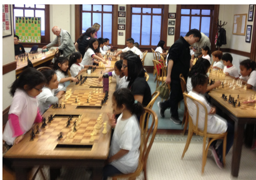
Chess Camp, 2015