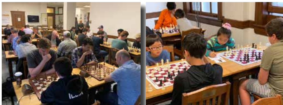
Mechanics' hosts chess tournaments for all ages.

Chess camps are an exciting way for kids to play chess and socialize over the board. Mechanics' Institute Chess Club's summer camps are winding down, but we will continue to offer camps during the holiday season. Check out dates and more at our website. milibrary.org/chess/scholastic-chess