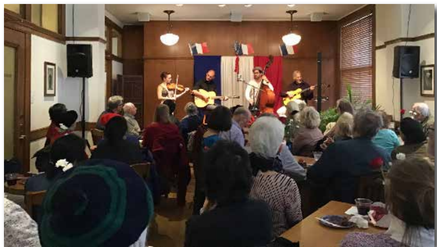
Le Jazz Hot

On July 14, Mechanics' Institute's annual Bastille Day celebration attracted new faces and longtime members to celebrate Fête Nationale with Le Jazz Hot at the helm. Attendees were treated to hors d'oeuvres and beverages befitting the celebration of the storming of the Bastille, the end of feudalism in France, and the Declaration of the Rights of Man and of the Citizen .