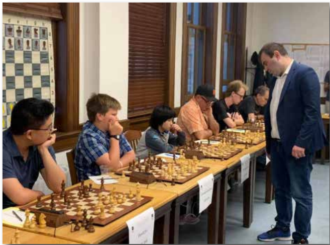
GM Shakhriyar Mamedyarov and competitors