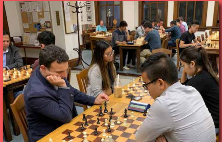
Tech professionals gather on a weekday evening for casual play at the club.