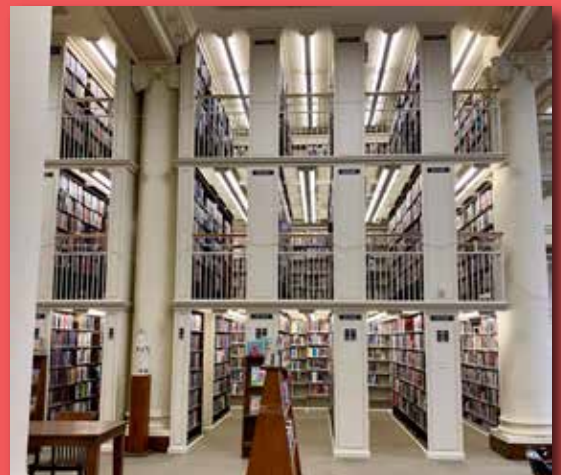
Find fiction, DVDs, graphic novels, and more on the second floor of the library.