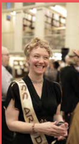
Attendees of the 100th Anniversary Celebration of the Golden Gate International Exposition enjoy costumes and camaraderie in the library.