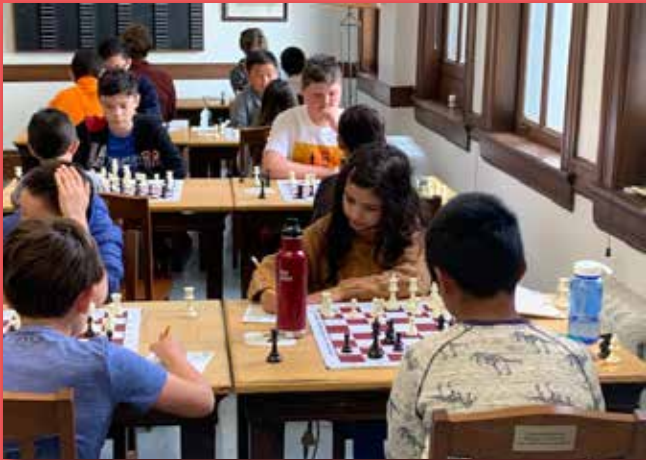
Chess players compete at the recurring Scholastic Chess Tournament at Mechanics' Chess Club.