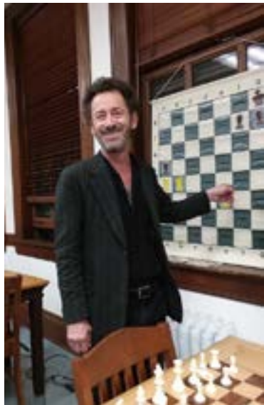
Three-time US Champion GM Nick de Firmian (below) and FM Paul Whitehead (above) teach engaging online courses for our chess community and members.

Class details can be found on the chess classes page of our website. Classes are 60-90 minutes long and conducted via Zoom. Details of the class are sent via email. If registering for multiple classes, registration can be used within the next two months.